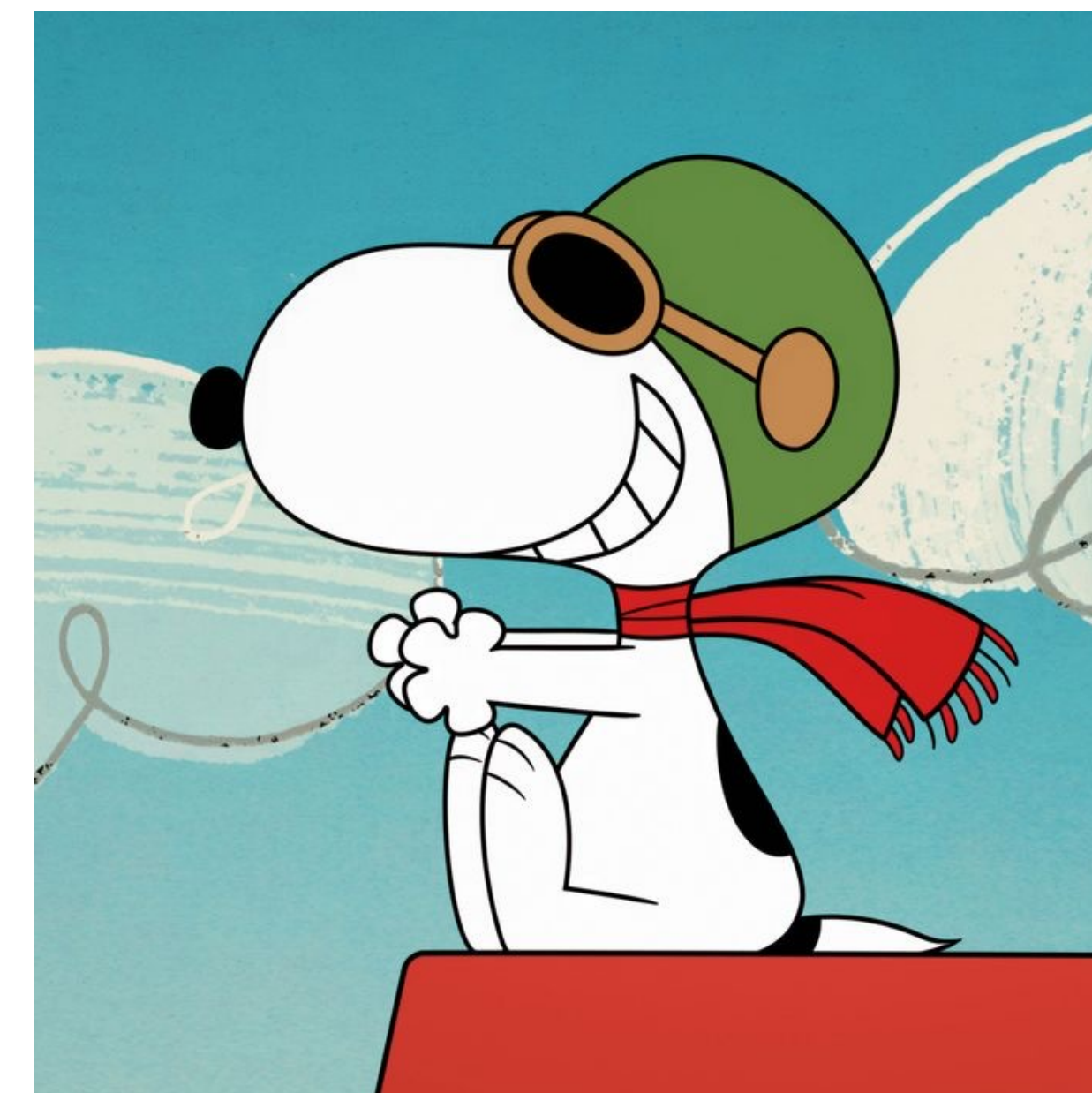
Fig 1. Snoopy as Flying Ace. "The Snoopy Show Preview." Vulture . https://www.vulture.com/article/the-snoopy-show-apple-tv-review.html