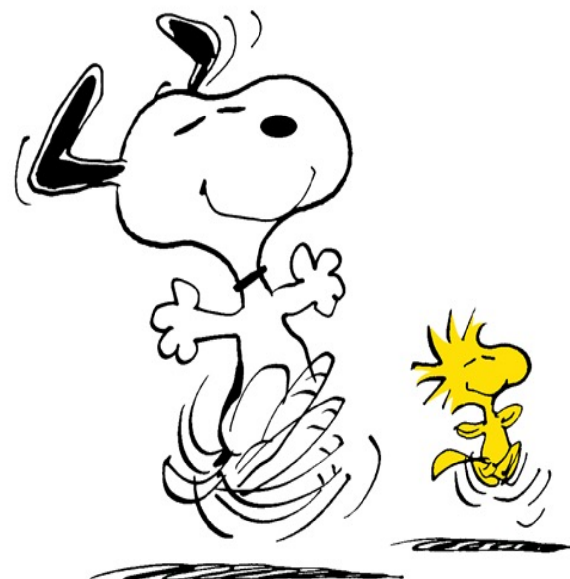
Fig 2. Snoopy's Happy Dance. "Snoopy Teaching Woodstock the Happy Dance."